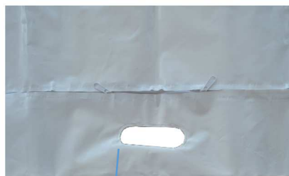
punched (out) handles