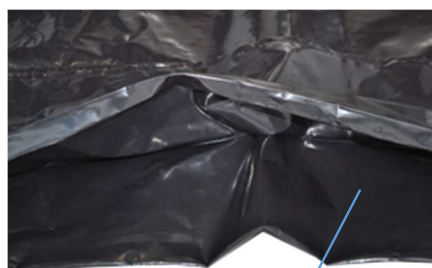
straight zipper & side gusset